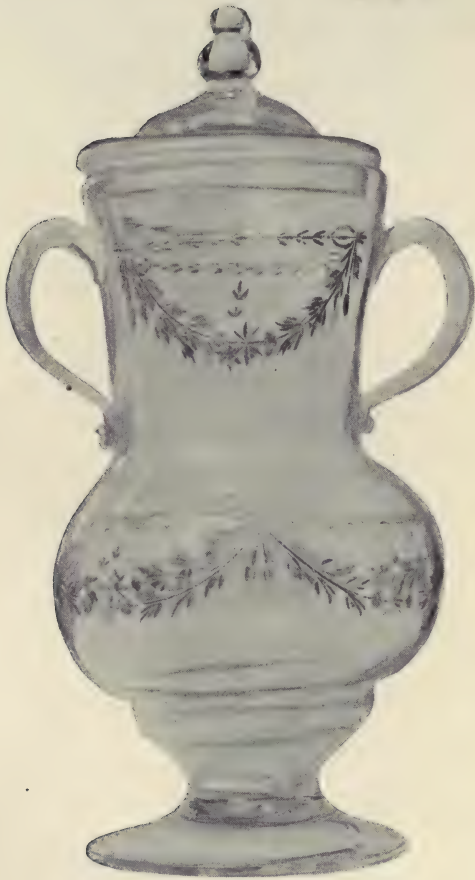
VASE San Ildefonso